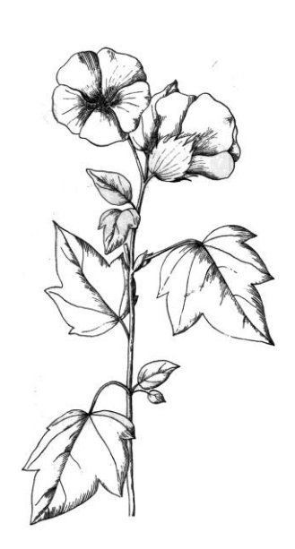
Cotton Gossypium hirsutum