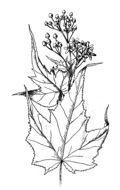
Virginia Mallow Sida hermaphrodita

Gradually the roadside vegetation changed from short grass to a dense curtain of Johnson grass Sorghum halepense , an invasive plant of Mediterranean origin, growing over 10 feet tall. Interspersed with these giants were unfamiliar hairy, mullein-like plants with spikes of large yellow flowers resembling those of snapdragons. These proved to be mullein foxgloves Dasystoma macrophylla , coarse relatives of the beautiful, but parasitic, false foxgloves (now classified as Aureolaria ) found in oak woodlands. The mullein-foxgloves must be of an ancient lineage of plants because their present-day distribution includes only North America and Madagascar, an unlikely combination of geographical areas and probably dating back