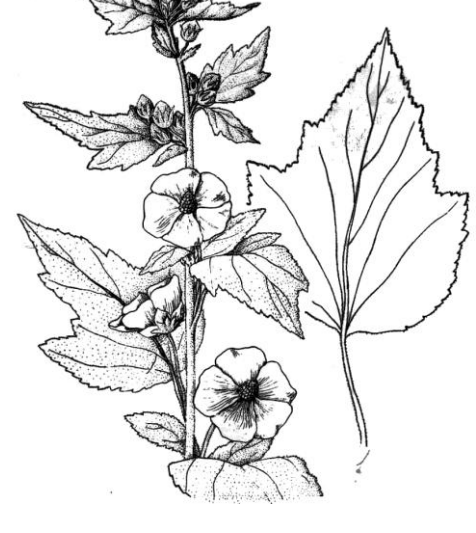
Marsh mallow Althaea officinalis

In 1992, the Nature Conservancy, a private conservation organization that specializes in protecting habitats of rare species worldwide (it currently protects the Elkhart River site of I. remota, ) acquired the mallow site on Peters