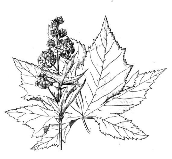
Glade mallow Napaea dioica

The site turned out to be on a railroad track about 80 miles south of Cleveland in a rolling plateau area not far from the old religious colony of Zoar, now a picturesque